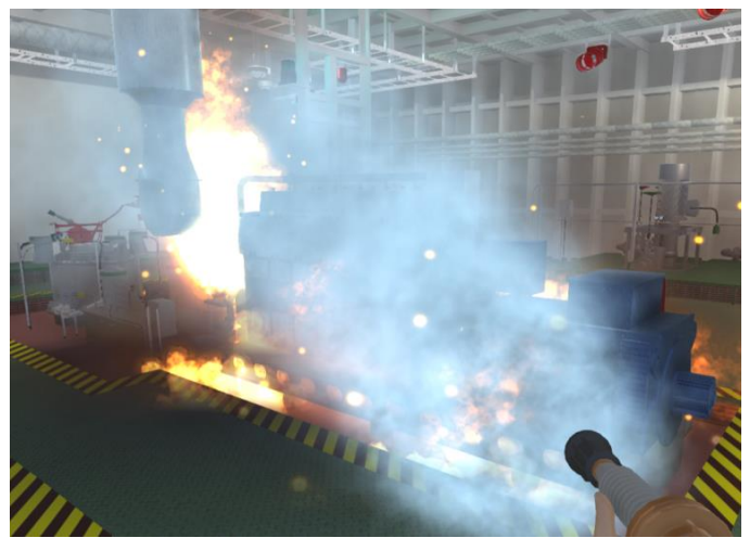
AFS Advanced firefighting simulator