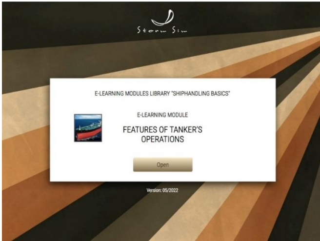
ELM "Features of tanker's operations"