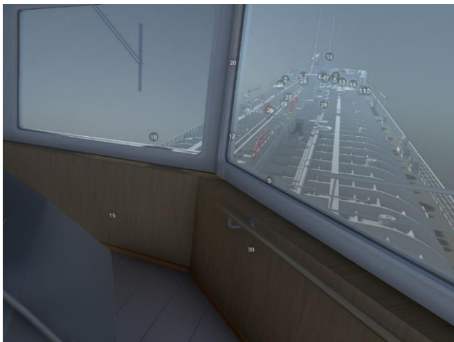
3D stand. Virtual ship. Crude oil tanker