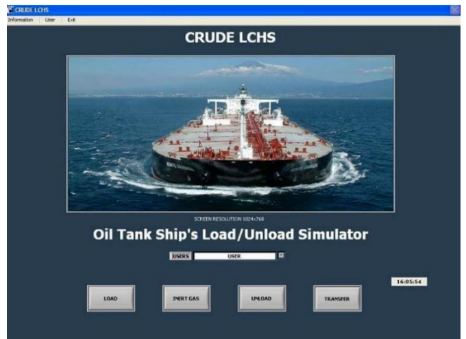
LCHS Liquid cargo handling simulator