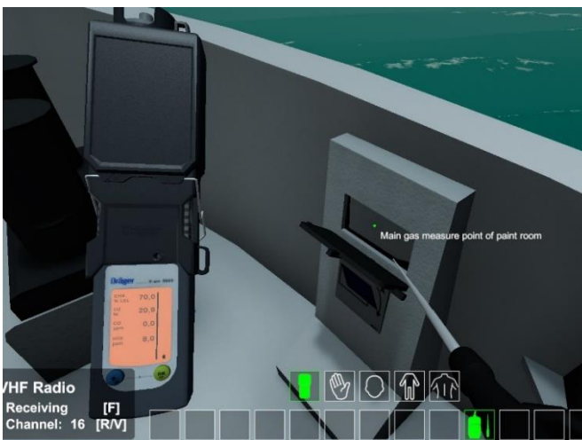
GDS Gas Detector Simulator